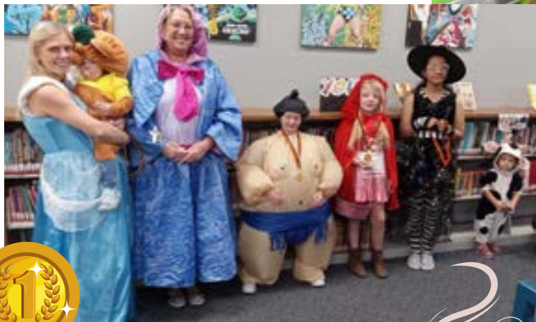
The winners of our 2nd Annual ACPL Costume Contest!